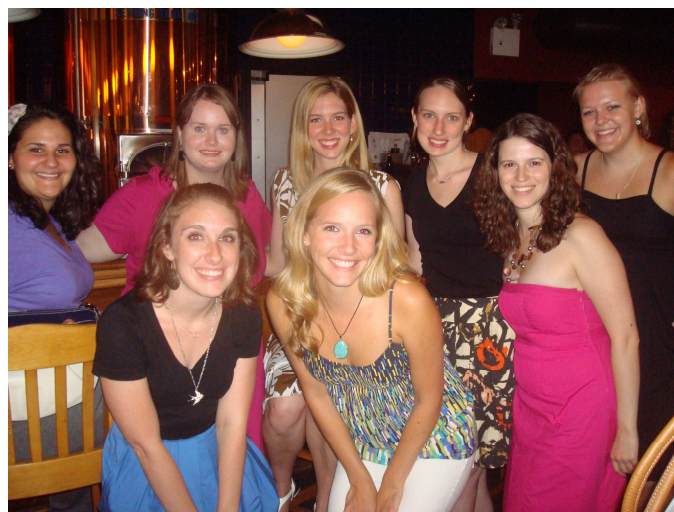
KDNyAA members at our end of August Happy Hour

Also, be sure to stay connected with us on Facebook, LinkedIn, http://kdneyaa.blogspot.com and our website: http://kdneyaa.homestead.com